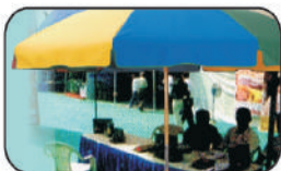
Open Table Space : Rs. 15,000/- 1 Excutive Big Umbrella, 1 Table, 2 Chair.