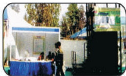
Open Space : Rs. 85,000/- 6x3 Mtr Space 3x2 Mtr Octonorm Stall 2 Table, 3 Chair