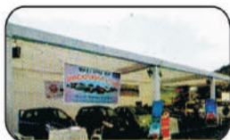
Premium Trust Stall: Rs. 35,000/- 3x3 Stall Carpet, Table, Chair.

Information Counter : Information Counters will be available at the exhibition hall to help you identify booth locations, Exhibitors and products.