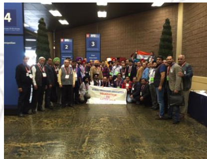
Exhibition Visitors at Las Vegas, USA