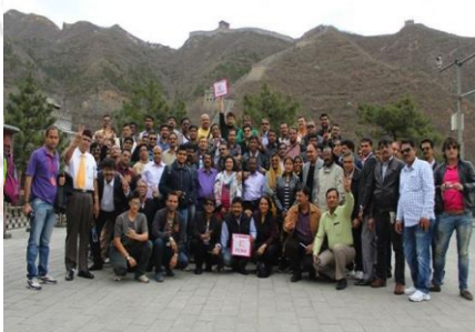
Exhibition Visitors at Beijing, China