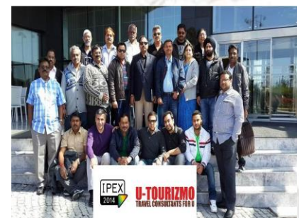
Exhibition Visitors at London, UK