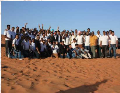
Dealer Meet For Aircel, Dubai, UAE