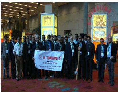
Exhibition Visitors at Atlanta, USA