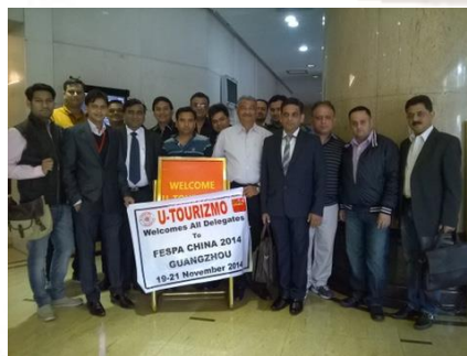
Exhibition Visitors at Guangzhou, China