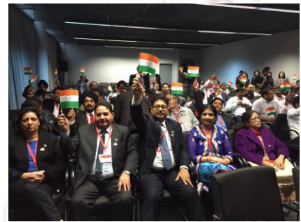
Exhibition Visitors at Shanghai, China