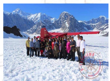
Family Group at Alaska, USA