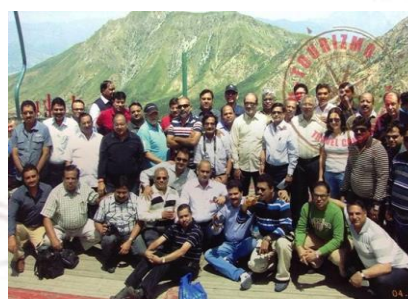
Association Meet at Tashkent, Uzbekistan