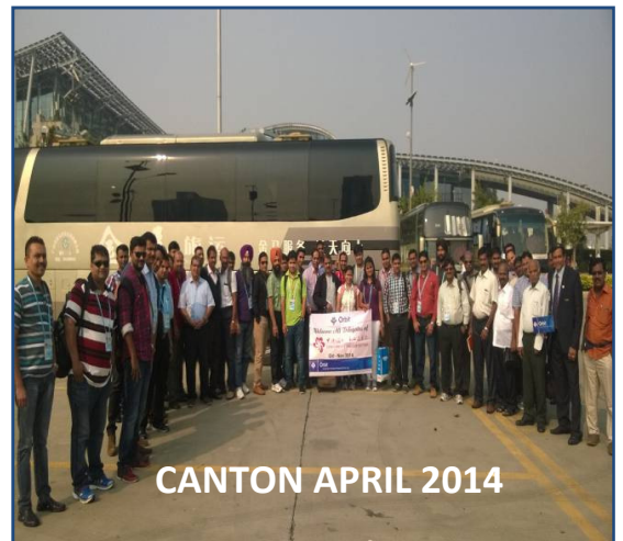
CANTON APRIL 2014