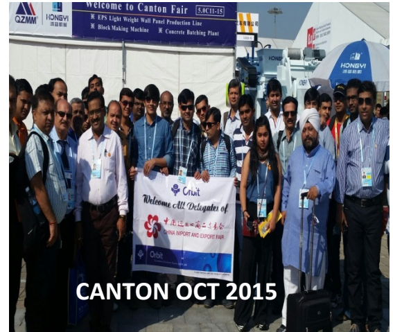
CANTON OCT 2015

Option of booking ONLINE - at www.orbitbusinesstours.com